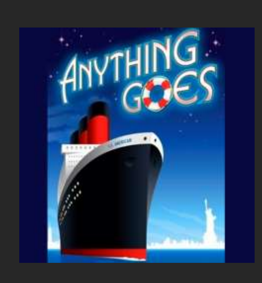
Mar 7^{th} – 16^{th} , Mar 21^{st} – 30^{th} , Apr 4^{th} – 13^{th} , Apr 25^{th} – May 4^{th} ,